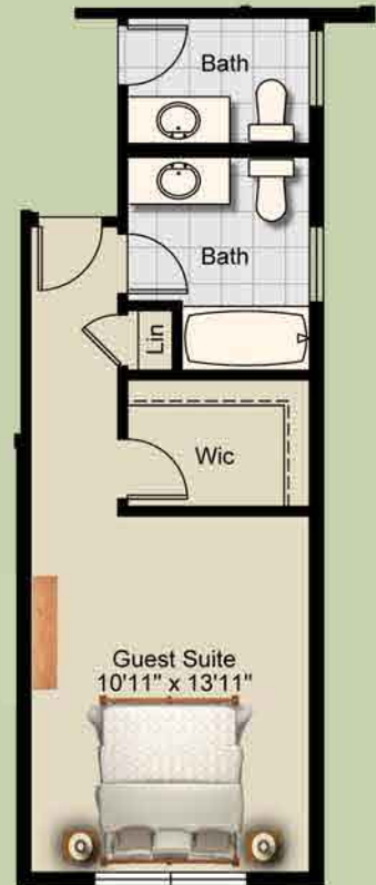
Optional Guest Suite