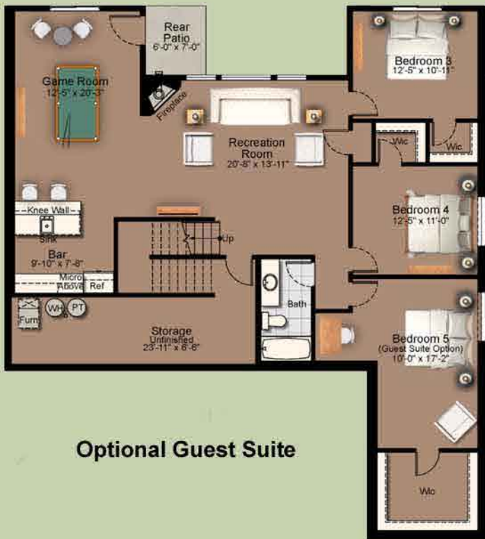
Optional Guest Suite