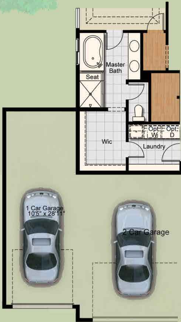
Optional 3-Car Garage