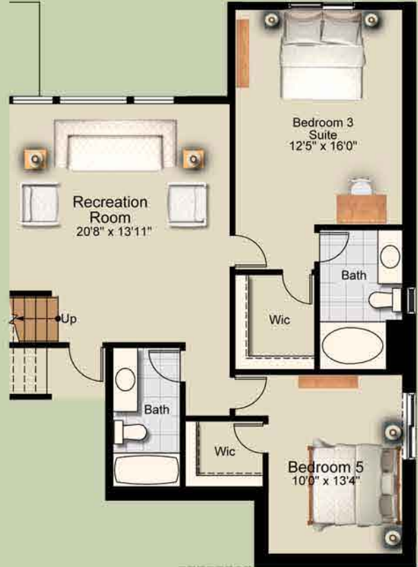
Optional Basement Suite